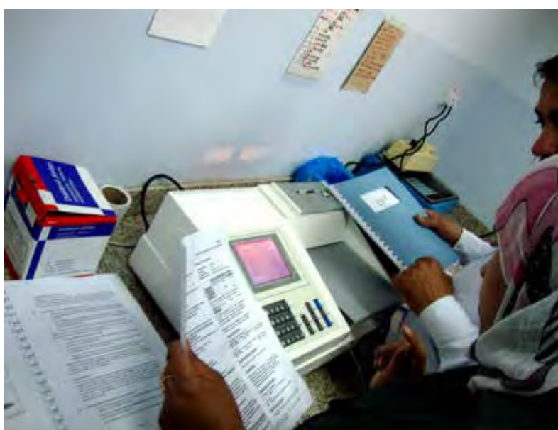
Install and train several medical equipment in several health centers in Jordan

Supply, installation and training of Spectrophotometer, ECG, EMG, Emergency Trolley in five major health centres in Jordan