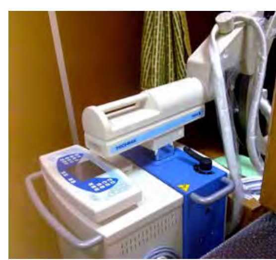
Installation of Extracorporeal shock wave lithotripsy (ESWL) in Daraa Hospital.

The Syrian Arab Republic hosts one of the largest urban refugee populations in the world, with nearly half a million Palestinians and hundreds of thousands of displaced Iraqis. Under the UNHCR programme to support the operations inside Syria, Protechnique Healthcare take the role to rehabilitate Darra Hospital by install and operate an Extracorporeal shock wave lithotripsy (ESWL).