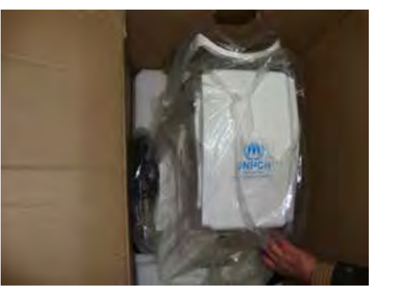
Surgical equipment, Obstetrics and Gynaecology Hospital, Syria