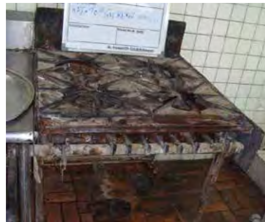
Before: Unworkable and burnt out cooking ranges and damaged tiles and equipment