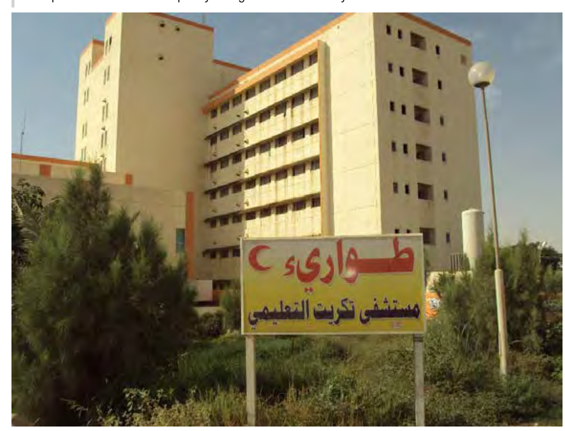
Takrit Hospital, Iraq (400 beds)

Protechnique Healthcare in association with Al Merhaj Engineering and Contracting under the Iraqi Ministry of Industry funded programme was involved in health planning and procurement and commissioning of equipment and furniture for the New Falloujha Hospital in Iraq. The hospital is of 200 beds capacity being built on a turnkey basis.