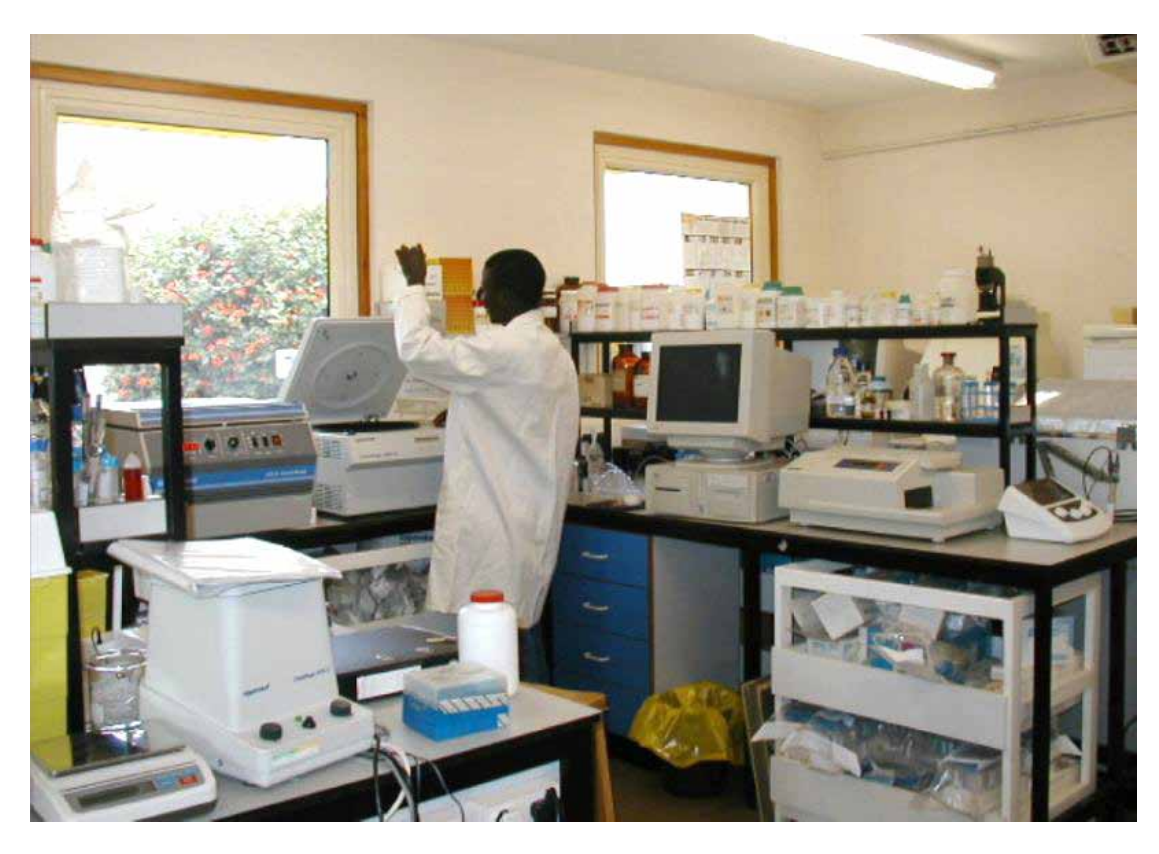
Supply and delivery of refrigerated bench top centrifuges

Supply and installation of laboratory equipment in Zimbabwe