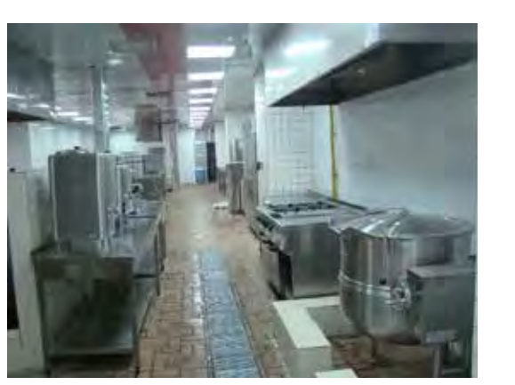
After: Completely refurbished kitchen with fresh tiles and modern, hygienic and efficient kitchen equipment, supplied and installed by Protechnique Healthcare

Protechnique Company is the contractor for the Project of "Rehabilitation of Takrit General Hospital, Salahaddin Governorate, Iraq (IRQ10- P/AM/241/08) as part of UNDP project.